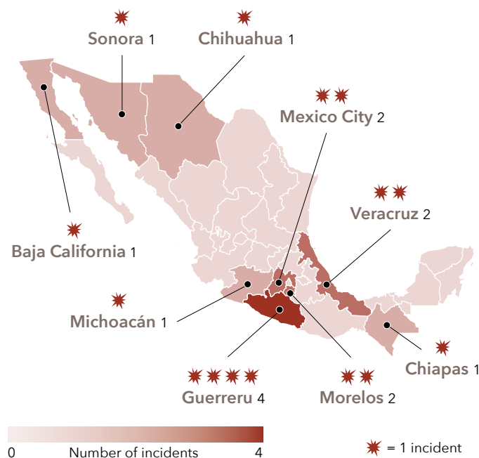
Known locations of reported incidents in Mexico in 2020, by state 6